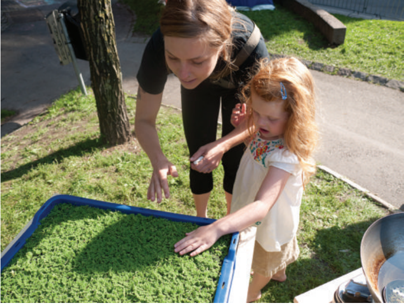
Visitors having a close look at Azolla at Stockholm Culture Festival