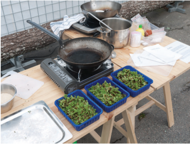
Preparing to cook Azolla at Färgfabriken in Stockholm