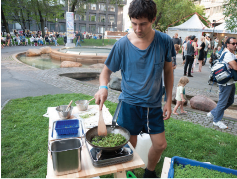
The author cooking Azolla at Stockholm Culture Festival