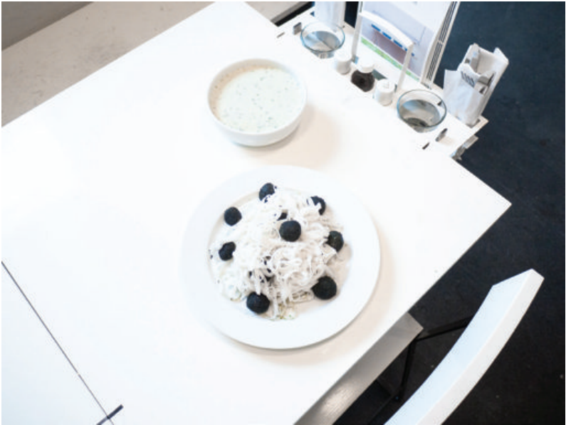
Azolla soup and Azolla balls with rice noodles at Färgfabriken in Stockholm

Experiments with Azolla in rice cultivation has for example just started in Italy where rice producers have problems with pollution and depleting soils. Using Azolla as an organic fertilizer in rice paddies is great, but when it becomes really interesting is when even more species are introduced in the paddy. A farmer in Japan, where Azolla commonly is regarded as a rice paddy weed, has recently shown that if rice is co-cultured with Azolla , fish and ducks in the same paddy you can get greater rice yields than with conventional rice farming while at the same time getting fish, duck meat and eggs. I think that systems like these are really promising and that what we need to do is to develop an agriculture with both a great diversity of systems and great diversity within the systems themselves.