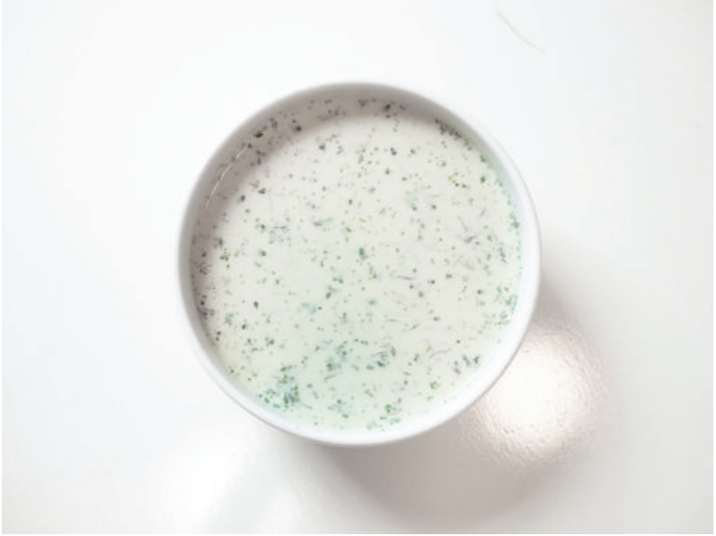
Azolla soup cooked at Färgfabriken in Stockholm

250g fresh or frozen Azolla 1 deciliter soy cream 4 deciliter water 1 vegetable bouillon cube Salt and pepper