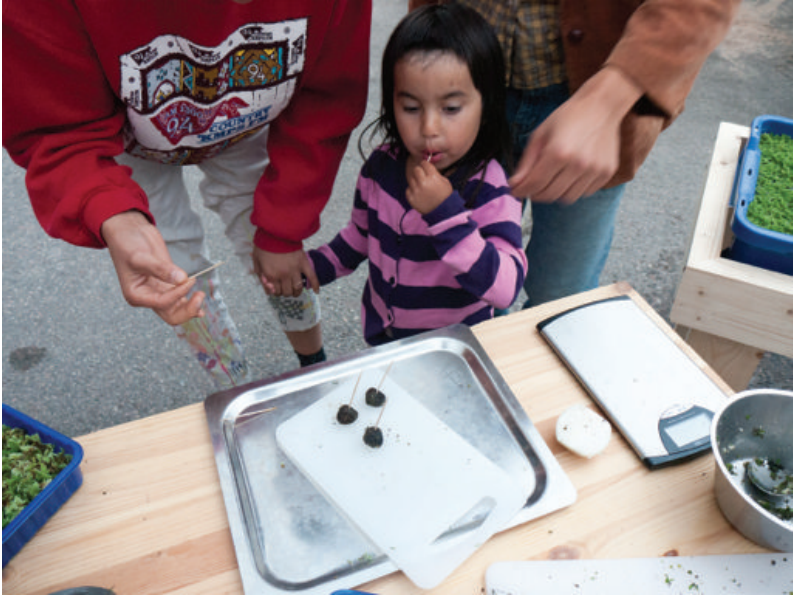
Visitors tasting Azolla balls at Färgfabriken in Stockholm