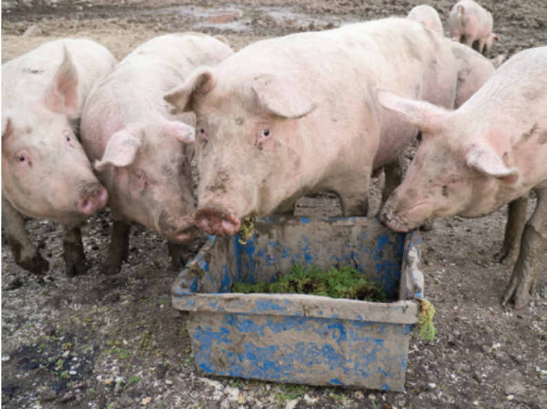
Pigs tasting Azolla at Hästa gård in Stockholm

Azolla is much more explored as an animal fodder than as food for humans. In India, it is common to cultivate Azolla as a supplemental fodder for cows and poultry, other animals that have been shown to eat Azolla are earthworms, snails, shrimp, fish, geese, rabbits, goats, sheep, pigs and horses. In some areas of Africa, wild Azolla is harvested from lakes and ponds and used as animal fodder [25, 21, 13]. Dried Azolla has been found less palatable for animals than fresh Azolla , and different strains of fresh Azolla vary in palatability [26].