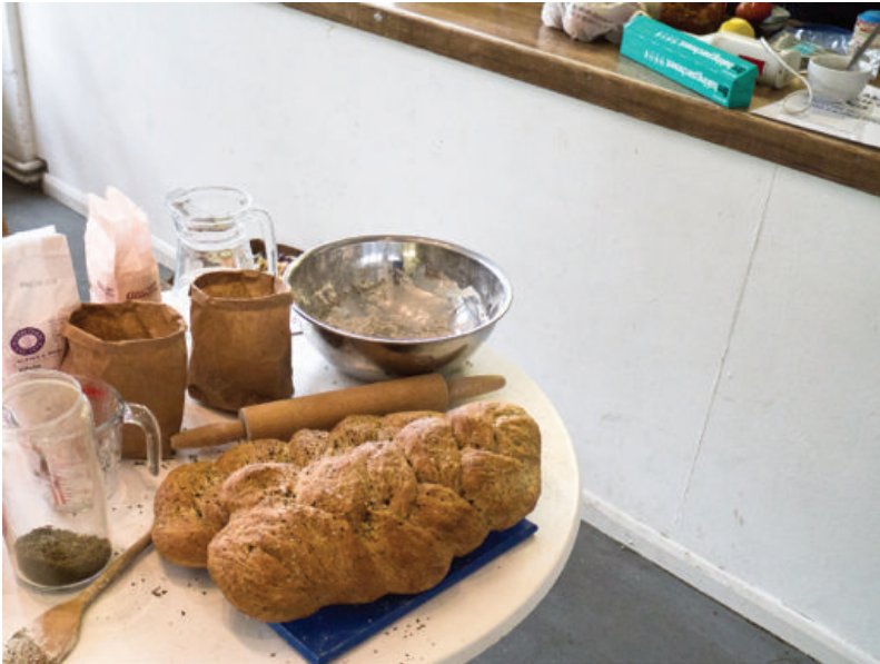
Azolla bread baked at Wysing Arts Center in England

2 deciliter wheat flour 1 deciliter dried Azolla 4 deciliter water 1/2 tablespoon salt