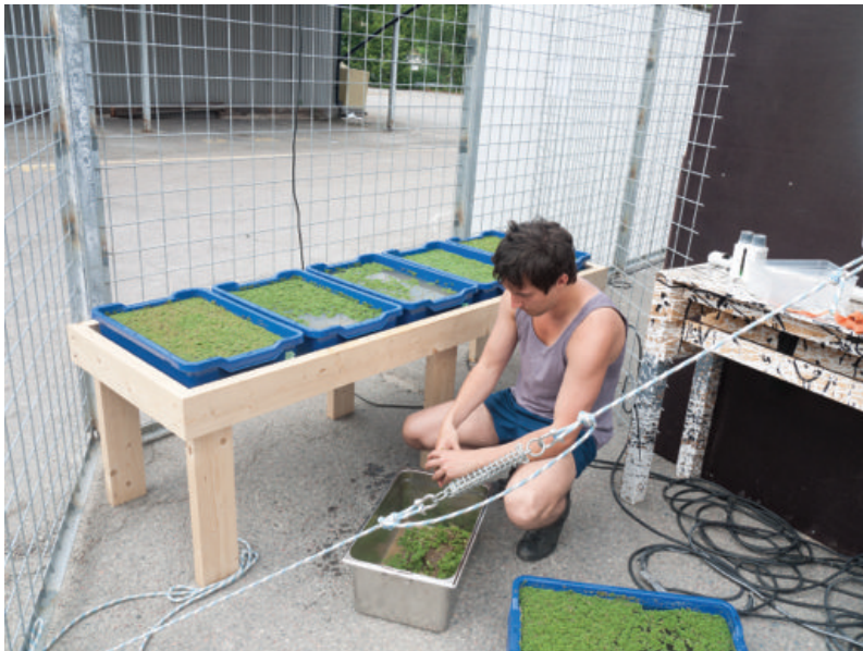
The author harvesting Azolla at Färgfabriken in Stockholm

Azolla has been used as an organic fertilizer in rice paddies for thousands of years in parts of China, but it is not until recently that this practice has started to spread to other parts of the world.