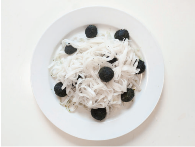
Azolla balls with rice noodles cooked at Färgfabriken in Stockholm