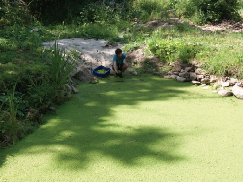
The author harvesting Azolla at Kultivator on the island of Öland, Sweden