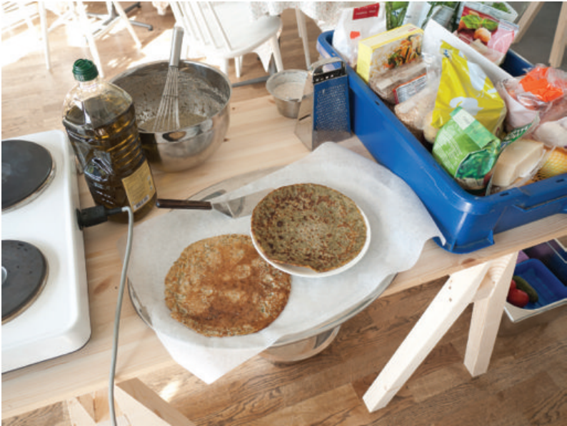
Azolla pancakes cooked at Halikonlahti Green Art at Salo Art Museum in Finland

100 grams fresh or frozen Azolla 1 egg (preferably a duck egg) 4 deciliter milk 2 deciliter wheat flour 1/2 teaspoon salt Oil