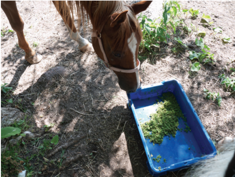
Horse tasting Azolla at Kultivator on the island of Öland, Sweden

With horses it was the reverse, the horses on Öland seemed to like the plant while the horses in Stockholm did not.