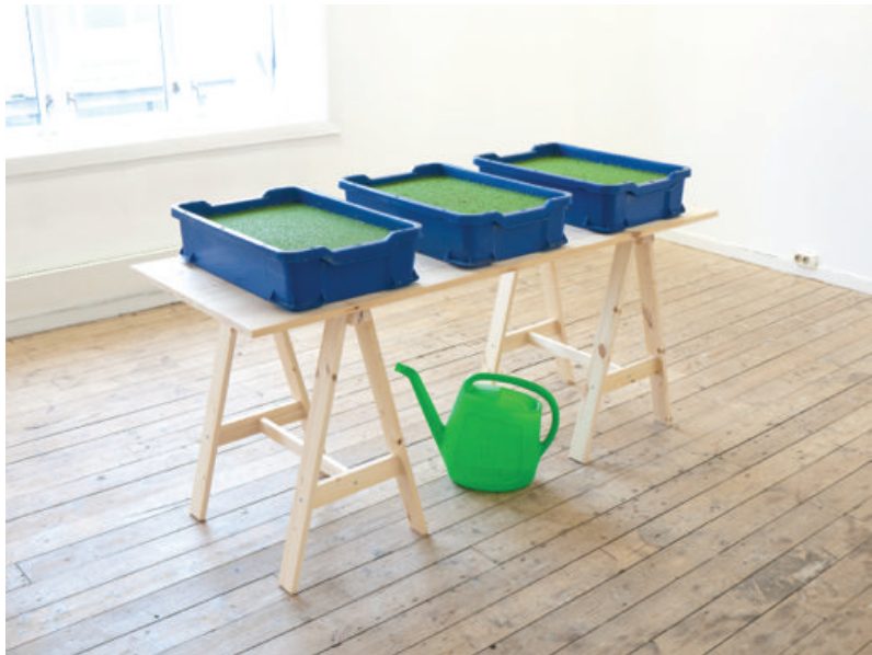
Azolla cultivation at Rogaland Kunstcenter in Stavanger, Norway